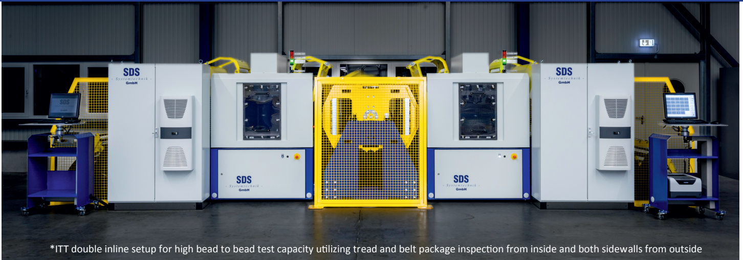
*ITT double inline setup for high bead to bead test capacity utilizing tread and belt package inspection from inside and both sidewalls from outside

The fastest solution for Inline Bead to Bead inspection